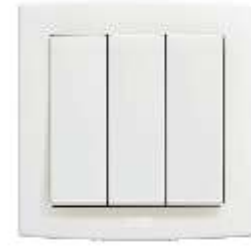
3 gang switch