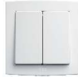
2 gang switch