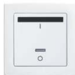
ACR101 / ACR102