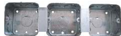
3 gang box