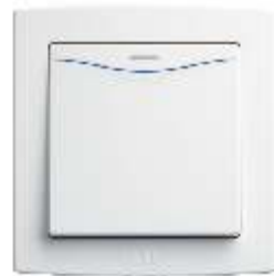
1 gang switch with LED