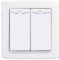
2 gang switch with LED