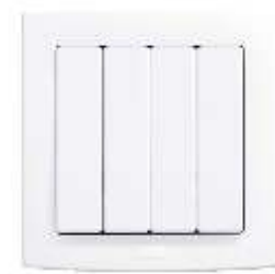
4 gang switch