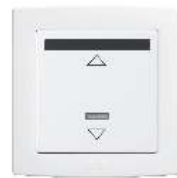
ACR103 / ACR104