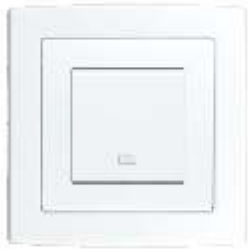
32A DP Switch