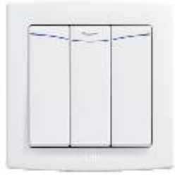
3 gang switch with LED