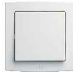
1 gang switch